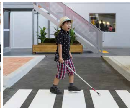
The Leigh Garwood Mobility Training Centre